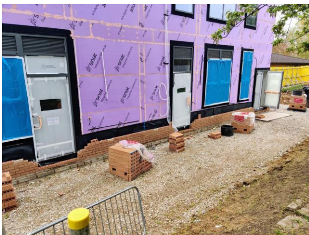
The outside of the new PMLD classrooms. Which will have their own courtyard.

Following the new build module delivery, work continues on both the inside and outside of the building.