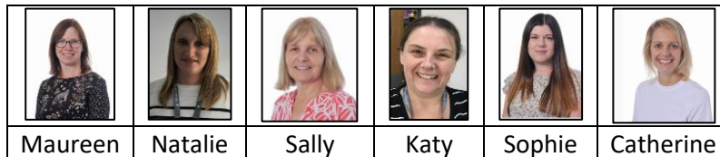
Mulberry Class Team