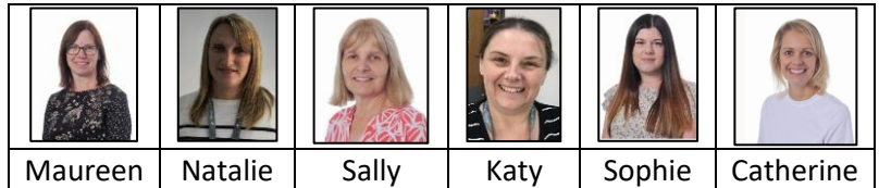
Mulberry Class Team